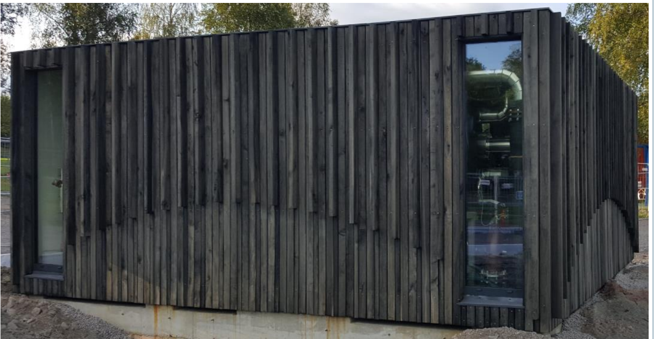
Customized module exterior view example 2