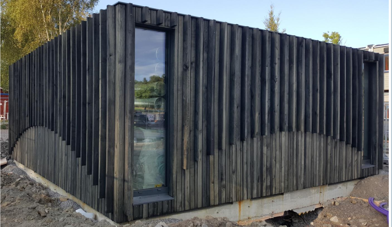
Customized module exterior view example 1