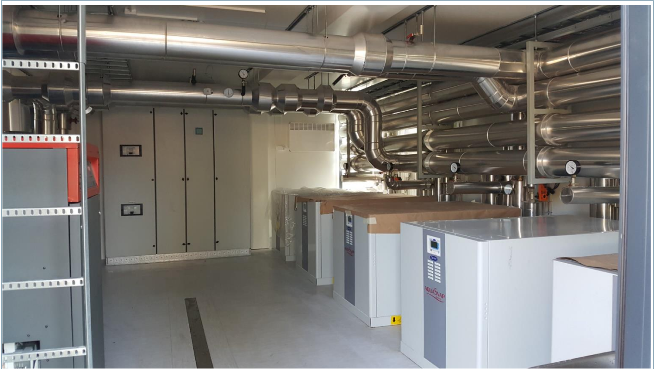
Customized module interior view example 1