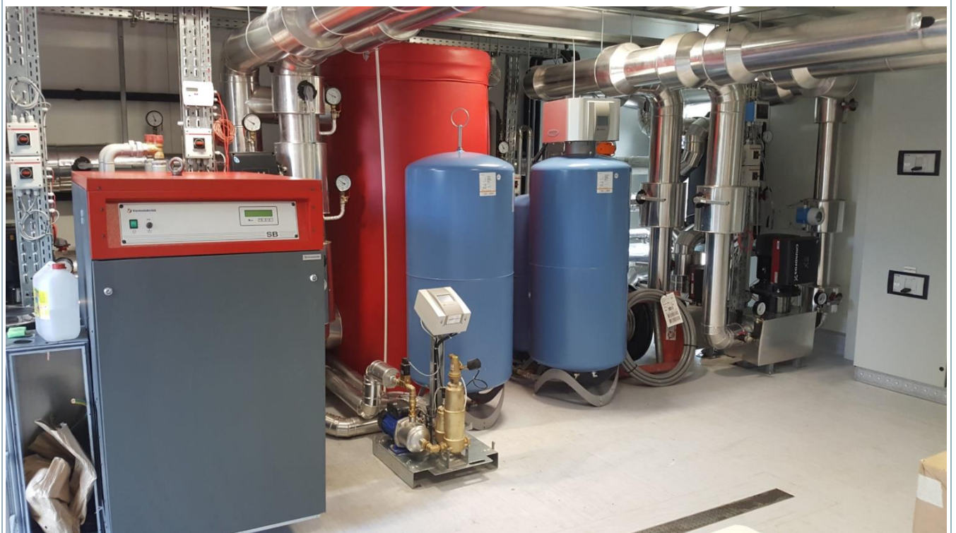
Customized module interior view example 2