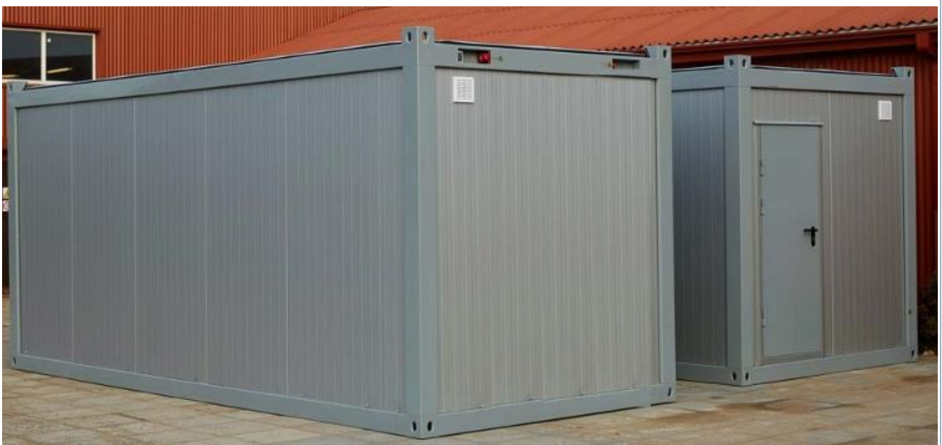
Standard module exterior view example